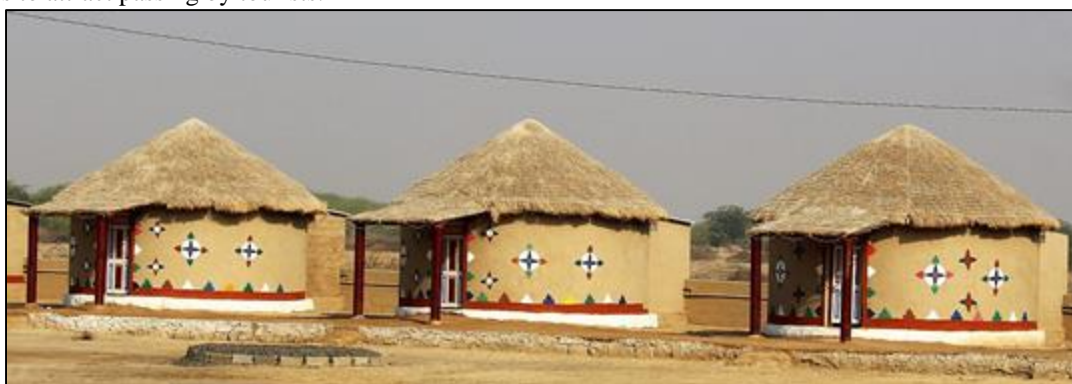
Fig. 2: Cluster of Bhunga

The planning of these local resorts are done in such a way that it provides an essence of local village culture. These resorts have traditional bhungas and tents planned in a cluster form having common sit-out spaces to give essence of villages. This resorts have designated spaces given for cultural activities, such as traditional dance and music performances. Some resorts also have shops and restaurants to attract passing by tourists.