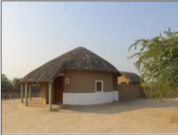
Fig. 3: Front View of Bhunga

Bhungas & Tents are meticulously constructed in the traditional way. At first stone wall is constructed then on that 5-6mm mud and cow dung plaster is done after that wooden frame is constructed for roofing over which thatch is kept to cover the roof. It takes about 25-27 days to construct a bhunga and its cost around three lakhs per bhunga including labour, material and construction cost.