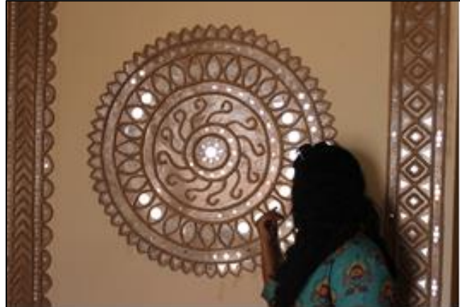
Fig. 6: Mirror work on walls