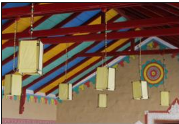
Fig. 5: Wooden roof with vibrant colors

The materials used in the resort are mud plaster, Perdi stone, paint colors, precast pillars etc. The mud plaster at walls is called Lipan while at floors is called Lipi. It is made in ratio of one part cow dung to one part mud. The plaster thickness is 5-6 mm and this is very effective in stopping heat transfer. Heat transfer in mud takes 12-13 hours, hence the temperature of Bhungas remains cold during day time and warm during night. The stone used in walls is bought from Mandvi and Precast columns are delivered from Bhuj. All the bhungas are traditionally crafted with interior mud work and decorated with traditional cloth patch works and local paintings and mirror work on the wall, beautifully decorated feature en-suite bathroom facilities.