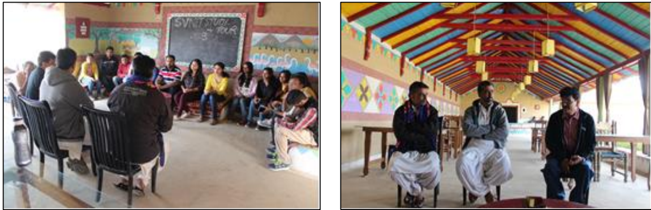
Fig. 7: Students of SVNIT, Surat conversing with public representatives of Hodka village