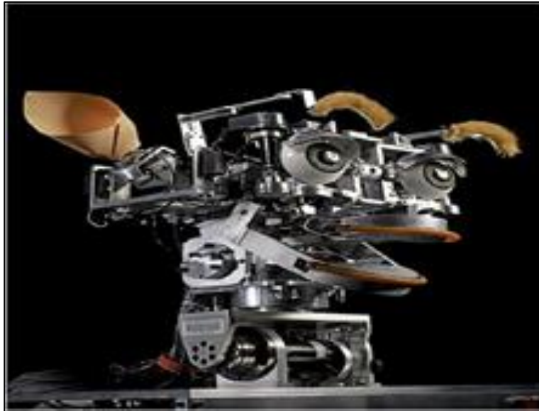
Fig. 3: Kismet, a robot with rudimentary social skills Emotion and social skills play two roles for an intelligent agent

First, it must be able to predict the actions of others, by understanding their motives and emotional states. (This involves elements of game theory, decision theory, as well as the ability to model human emotions and the perceptual skills to detect emotions.) Also, for good human-computer interaction, an intelligent machine also needs to display emotions. At the very least it must appear polite and sensitive to the humans it interacts with. At best, it should have normal emotions itself.