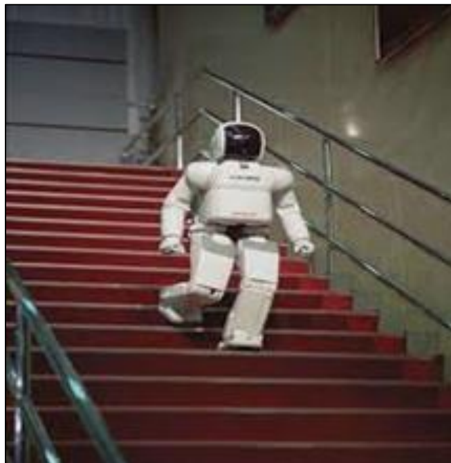
Fig. 2: ASIMO uses sensors and intelligent algorithms to avoid obstacles and navigate stairs. Main article: Robotics

The field of robotics is closely related to AI. Intelligence is required for robots to be able to handle such tasks as object manipulation and navigation, with sub-problems of localization (knowing where you are), mapping (learning what is around you) and motion planning (figuring out how to get there).