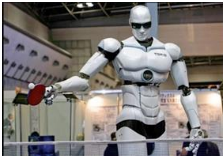
Fig. 4: TOPIO, a robot that can play table tennis, developed by TOSY

A sub-field of AI addresses creativity both theoretically (from a philosophical and psychological perspective) and practically (via specific implementations of systems that generate outputs that can be considered creative). A related area of computational research is Artificial Intuition and Artificial Imagination.