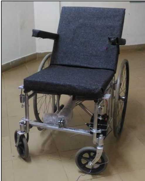
Fig. 3: Wheelchair developed

The controlling of the proposed system can be done so easily with just the help of fingers. A joystick is connected on the arm rest of the wheelchair which is so smooth that the person doesn't feel any kind of difficulty while using. The person can lift his own weight and also even more if he carries anything with him, with the help of just one finger. He doesn't have to rely on others for help. Braking is provided so that the chair does not move while the person stands up. Anti-tippers are provided behind the chair that supports the chair from falling backwards. Also, it can help in balancing the chair to a certain extent. Extra stability mechanism is adopted so as to keep the chair stable in standing posture. This mechanism restricts falling sideways in standing posture. The working of this is like, when the person starts getting up, the footrest starts moving downwards. So, the footrest part reaches the ground, and the whole body weight will be on the ground. There are bushings provided at the tip of footrest to ensure proper grip on the floor. Safety belts are provided to hold the person on the seat throughout. The proposed system consists of chest belts, thigh straps, knee belts and heel straps.