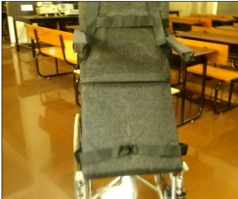
Fig. 5: Standing Wheelchair