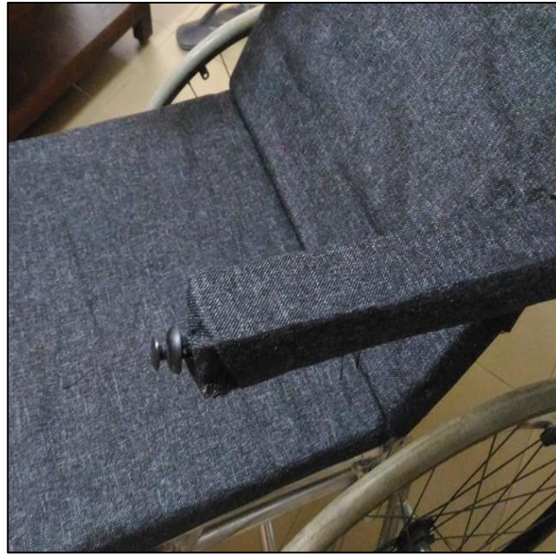
Fig. 4: Wheelchair developed