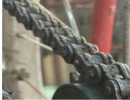
Fig. 4: Chain

A bicycle chain is a roller chain transfer's power from the pedals to the drive wheel of a bicycle, thus propelling it. Most bicycle chains are made from plain carbon or alloy steel, but some are nickel plated to prevent rust, or simply for aesthetics. In order to reduce weight, chains have been manufactured with hollow pins and with cut outs in the link. A recent trend is chains of various colors, and at least one manufactured offers a chain model specifically for electrically bicycle.