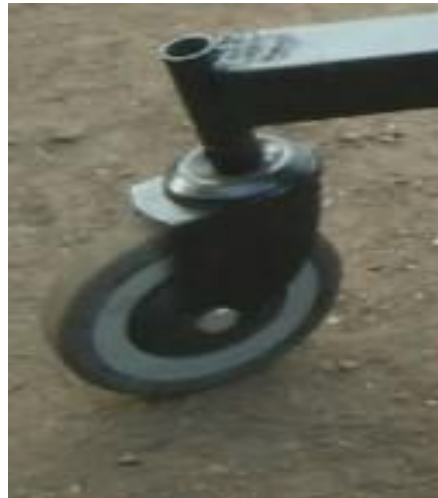
Fig. 5: Special wheel

It is a small wheel which is placed forefront of the wheelchair. This is fixed to the frame at the top with the help of bearings. Which is made up of cast iron rim with rubber soal is pasted above that. Its main function is given the direction and stability to the wheel chair.