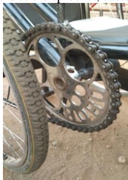
Fig. 3: Crank set

The crank set or chin set is the component of a bicycle drive train that converts the reciprocating motion of the riders legs into rotation motion used to drive the chain or belt, which in turn drive rear wheel. It consists of one or more sprockets, also called chain ring or chin wheel attached to the crank, arms, or crank arms to which the pedals attach. It is connected to the rider by the pedals, to the bicycle frame by the bottom bracket, and to the sprocket, cassette or freewheel via the chin.