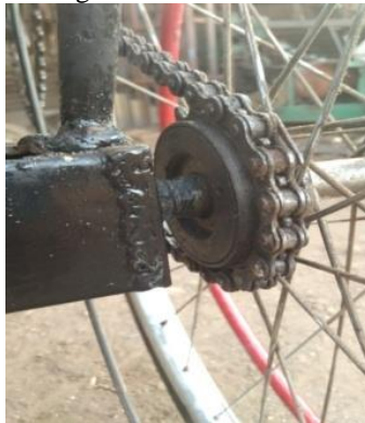
Fig. 2: Cogset

Cogset or cluster is the set multiple sprocket that attaches to the hub on the rear Wheel. A cogset works with a rear derailleur to provide multiple gear ratios to the rider. Cogset comes in varieties, cassette or freewheel, of which cassette are a never development. Although cassettes and freewheel perform the same faction and look almost the same when installed, they have important mechanical differences and are not interchangeable.