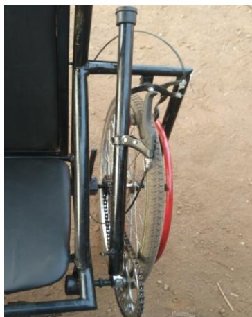
Fig. 6: Lever

It is a simple mechanical member that will used to transmit or lift the heavy weight by application of small external force applied on it. May be solid type or hollow type. In this we are using hollow lever which contains brakes and also which are attachable or detachable type in nature.