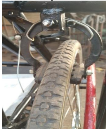
Fig. 7: Brakes

This is safety device used to stop, slow down or turn the wheel chair as required conditions. In this we are using normal bicycle brakes which are attached to the rear wheel that will used to stop or slow down the wheel chair.