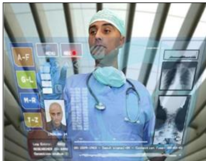
Fig. 2: Doctor verifying patient's details

Cloud computing describes a new supplement, consumption, and delivery model for IT services based on Internet protocols. Due to data integration and sensor based systems Doctors find their jobs much easier. Fig.1 shows a Doctor using touch screen to verify scan details of his patient. At the level of the individual, telemedicine can support improvements in a patient's health and quality of life, particularly for those with chronic diseases, by enabling safer monitoring at home and reducing the number of hospital visits.