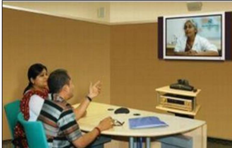
Fig. 6: Patient's video conferencing with doctor

Apollo Telemedicine, told ZDNet Asia in an e-mail interview: "Every day, we treat around 100 patients, spread across India in various specialties through the Apollo Telemedicine Networking Foundation (ATNF)."