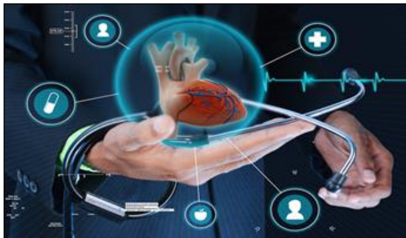
Fig. 7: Telemedicine