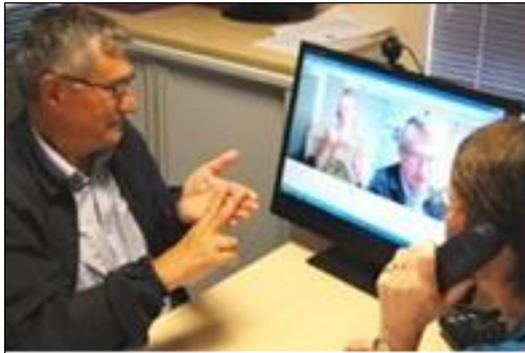
Fig. 3: Video conferencing between doctors

Healthcare organizations and providers now use web based conferencing to improve efficiency and reduce travel costs for both themselves and for their patients. The following example shows how simple the technology gives more efficiency and visceral benefits.