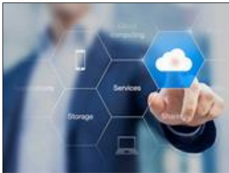
Fig. 5: obtaining any data at any time

Continuous and pervasive medical monitoring is now available with the present of wireless healthcare systems and telemedicine services. In emergency situations, real-time health parameter is crucial. Wireless technology could be the best solution for mass emergency situations like natural or human-included disasters and military conflict where patient's records such as previous medication history, Identification and other vital information are necessary. With the assistant of hand held devices in which wireless network integrated, the amount of time the doctors need to identify the problem, trace back the medication history of the patient and consult fellow doctors will be reduced significantly. Moreover, databases of patients that can be built up by continuous medical monitoring will be accessed and updated easily. This has improved both the efficiency and accuracy of the records, as well as save time as there is no duplication of work and no dictation is required. The rapid growth of the technologies extends the potential for exploitation of wireless medical application market. Nowadays, the large-scale wireless network and mobile computing solutions, such as cellular 3G and beyond, Wifi mesh and WiMAX, caregivers can access into vital information anywhere and at any time within health care.