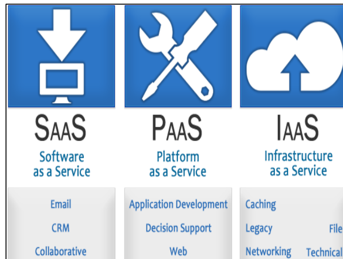
Fig. 1: (a) Business Model for CC