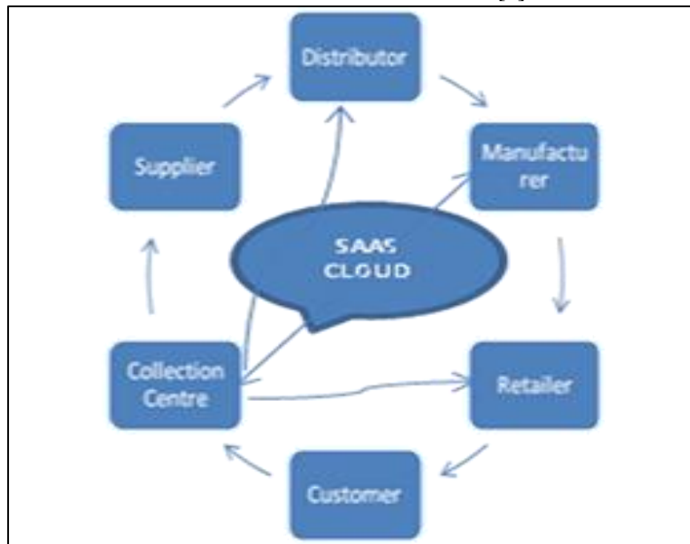
Fig. 2: GSCM with CC

Cloud offers Flexibility services through that any GSCM client gets benefit. The echelons of any organization which has different branches in different geographical can access the SAAS of cloud Fig 2. If the echelon of any organization scattered worldwide afterward it requires a discrete communications of cloud for every unit. Information allotments have to be consistent and protected among dissimilar echelons so in nearby no need of secretive cloud system. In secretive cloud communications allocation has completed trustworthy and protected way. Further with a centralized Cloud information hub, any organization should utilize disseminated information center under confidential cloud state of affairs [8].